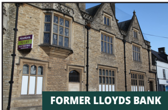
FORMER LLOYDS BANK

Thank you to those of you who responded to this survey. A small group of volunteers is looking at the evidence for these sites; it's a short list but valuable nevertheless, and the next step is to contact landowners. You can view the sites put forward on the Neighbourhood Plan website and we will be seeking your views on these heritage assets in the New Year.